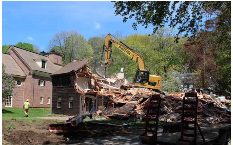
In preparation for building the Museum's new Education Center, the Cummings Davis Building was demolished on May 4, 2017.

raised a total of $11.5 million toward our $13 million capital and endowment campaign goal. We now need your help to make this vision for the Museum a reality! Please join the many friends who have enthusiastically supported this important project to help the Museum better serve the cultural and educational needs of our growing community. Every gift matters! To learn more, visit concordmuseumcampaign.org or contact Leah Giles at 978-369-9763 ext. 210.