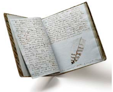
Henry D. Thoreau (1817–1862). Journal, 9 November 1858–7 April; The Morgan Library & Museum; purchased by Pierpont Morgan, 1909.

For a complete list of BE THOREAU programs concordmuseum.org