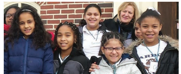
Students from the Tarbox School in Lawrence, a small neighborhood school with just over 350 students in grades 1-5, visited the Museum for our Digging into the Past program. Their visit was made possible through the donor-funded Paul Revere’s Ride program, which provides free bus transportation and waives fees for students with barriers to history education. “I love the museum – it was amazing!” one student wrote after her visit. “My favorite part was everything ,” wrote another.