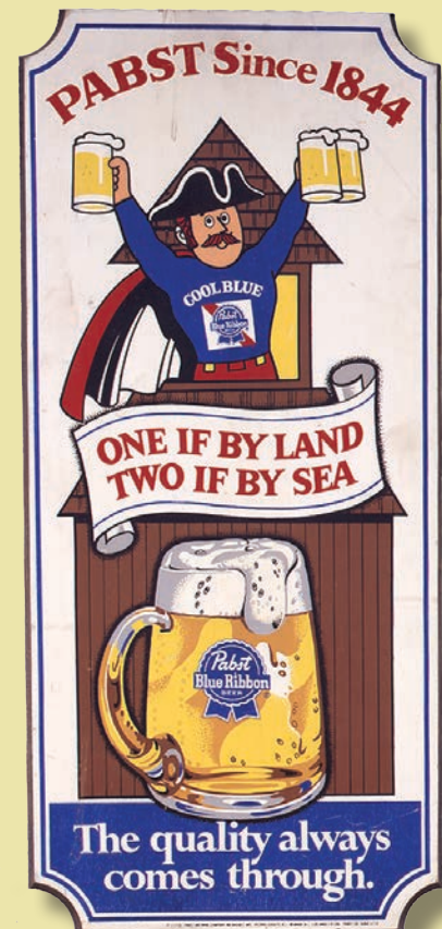
Sign, Pabst Brewing Co., 1965-75, Concord Museum, Gift of Cummings Davis Society (2005)

Members $5; Non-members $12 By reservation