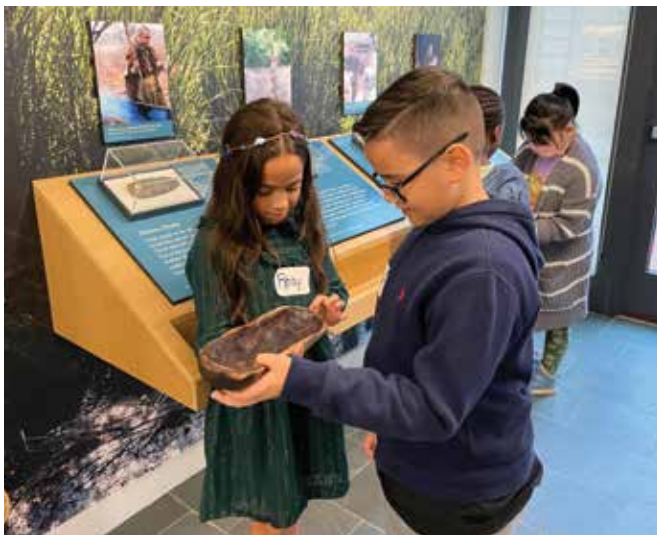
Students discuss how dug-out mishoons (canoes) are made during the Museum's program on Native history through archaeology.