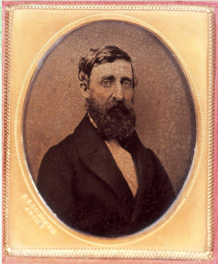
Henry David Thoreau